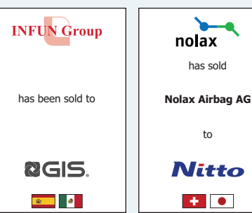
Automotive & Truck Automotive & Truck