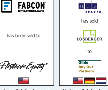
Building & Infrastructure