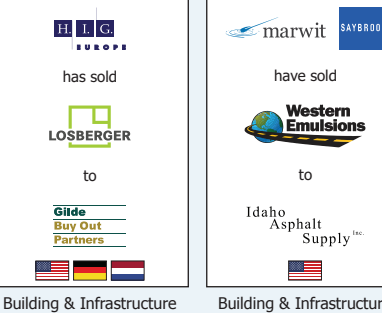
Building & Infrastructure